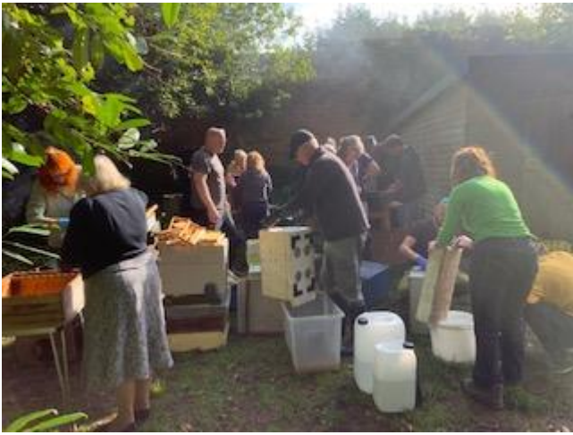
Apiary clean up and end of season BBQ